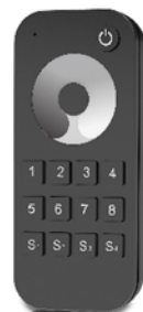
RT8 8 Zone Dimming