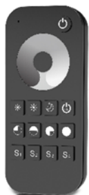
RT1 1 Zone Dimming

1,4 ,8 zone dimming/Touch color wheel/Wireless remote 30m distance/AAAx2 battery/Magnet stuck fix