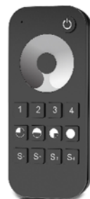
RT6 4 Zone Dimming