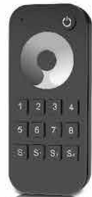
RT8 8 Zone Dimming