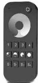
RT6 4 Zone Dimming