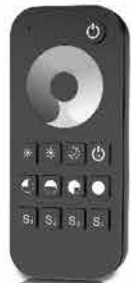
RT1 1 Zone Dimming

1,4,8 zone dimming/Touch color wheel/Wireless remote 30m distance/AAAx2 battery/Magnet stuck fix