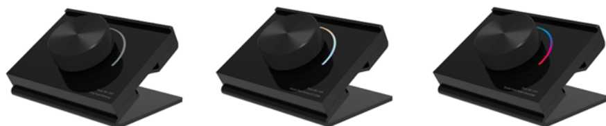
RK1 1 Zone Dimming

Rotary dimming/1-3 color/Wireless remote 30m distance/CR2032 battery